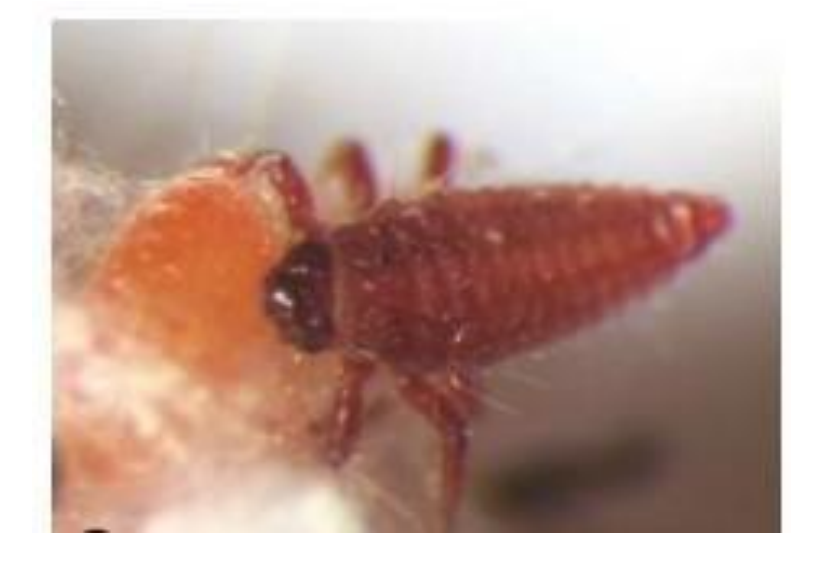
Fig.2 First instar of Vedalia Feeding on scale eggs.

Hunger also increases the consumption rate of prey by coccinellids. Suleman et al. , (2017) observed that starved beetles consume more aphids than unstarved aphids, also the preference of food also changes in starved and unstarved conditions.